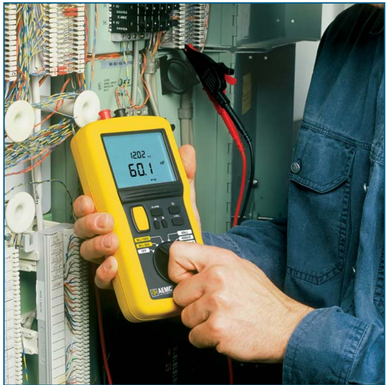
Safety rated 1000V clips provide quick and easy connection of test points for the Model 1039.