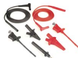
Test leads for Model 1039 Catalog #2119.40