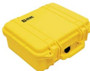
Field case for use with all models Catalog #2118.98