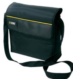
Soft carrying case included with standard megohmmeter models Catalog #2119.02