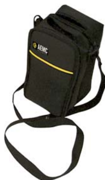
Hands-free carrying case for use with all models Catalog #2118.99