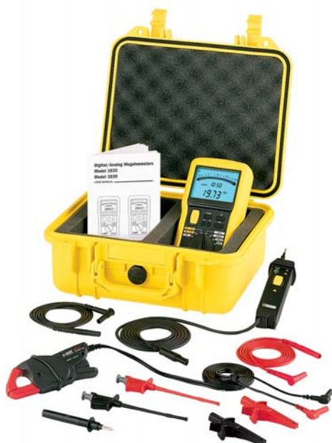
Model 1039 Field Kit, Catalog #2115.43