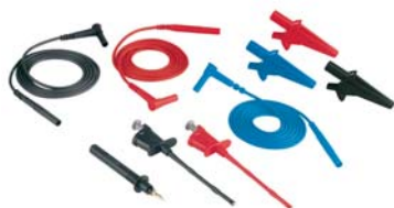
Test leads for Model 1035 Catalog #2119.41