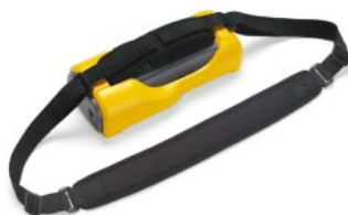
Optional SH 100 Shoulder Strap

Fluke. Keeping your world up and running.