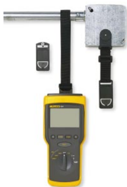
Optional TPAK Meter Strap and Magnet Hanging Kit