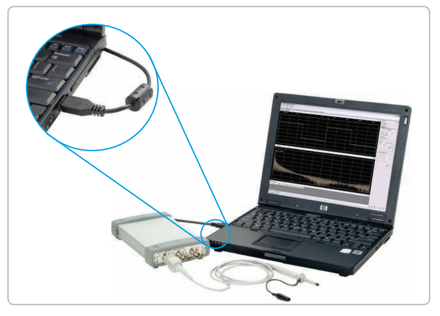
Figure 2. The U2701A and U2702A connect to the computer or laptop with a USB cable, enabling fast data transfer.

The U2701A and U2702A USB modular oscilloscopes offer analysis functions such as addition, subtraction, multiplication, division, and Fast Fourier Transform (FFT). FFT allows you to manipulate the waveform using five types of windows such as Hanning, Hamming, Blackman-Harris, Flattop, and Rectangular.