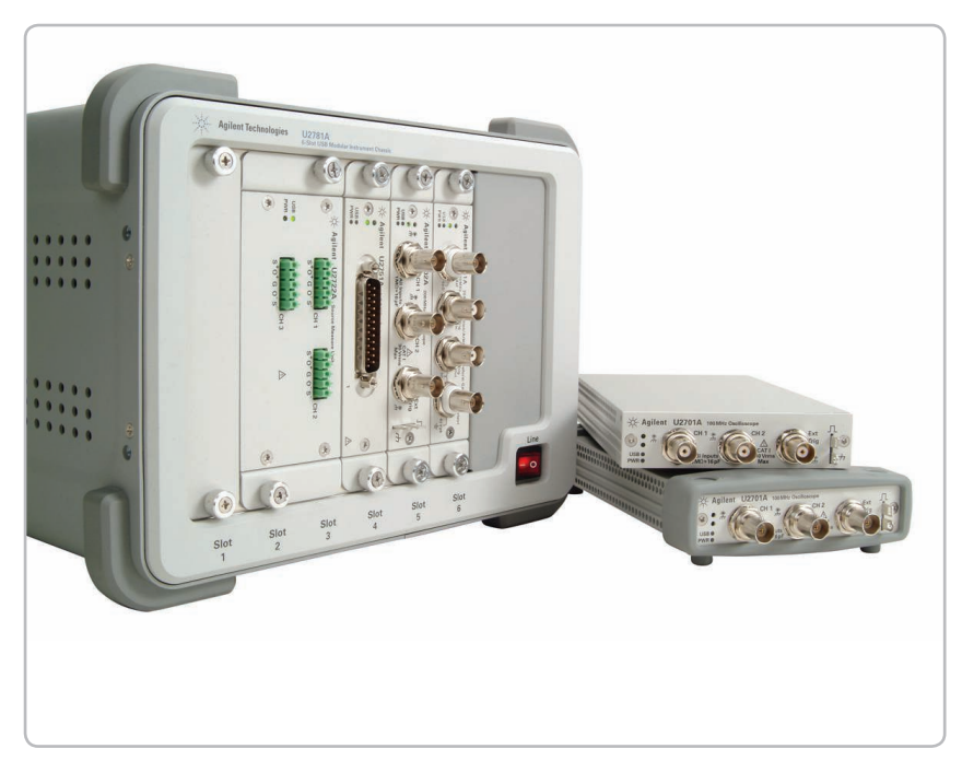
Figure 1. The dual-play capability allows the U2701A/U2702A USB modular oscilloscope to be used as a standalone unit or as part of test system in a cardcage.

The U2701A/U2702A USB modular oscilloscopes are equipped with High-Speed USB 2.0 interface for easy setup and plug-and-play. This ease of use makes the oscilloscopes ideal for the education, design validation and manufacturing industries.